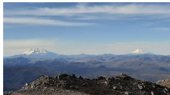
Antisana y Cotopaxi desde el Cayambe